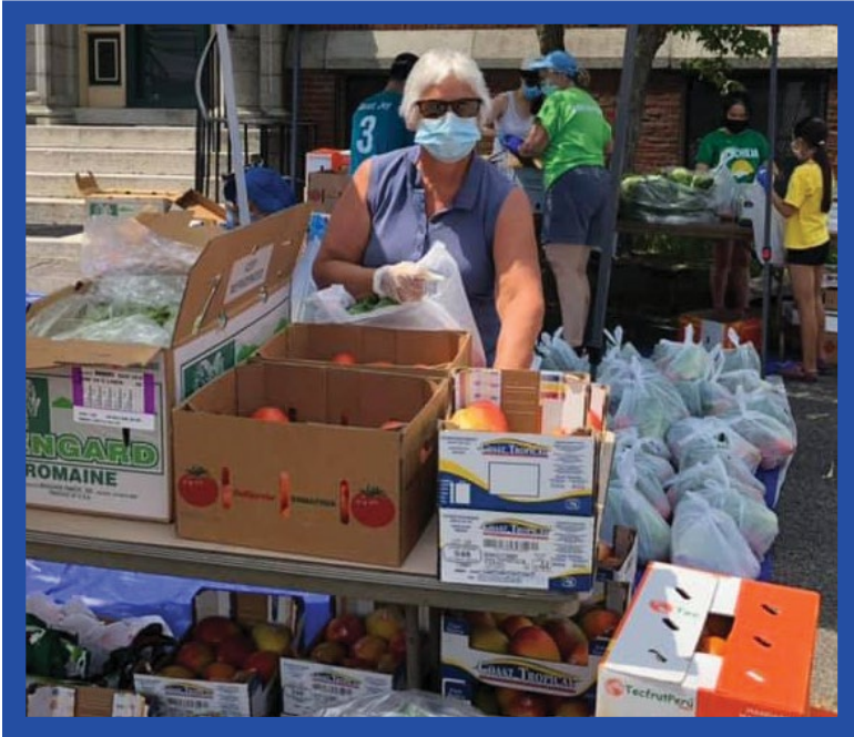
Since the start of COVID-19, Healthy Waltham has been serving more than 600 families every week at its mobile distributions.

When COVID-19 and the ensuing economic shock caused a surge in demand for food assistance this spring, community organizations across our service area stepped up to meet the need. In few places was this more apparent than Waltham.