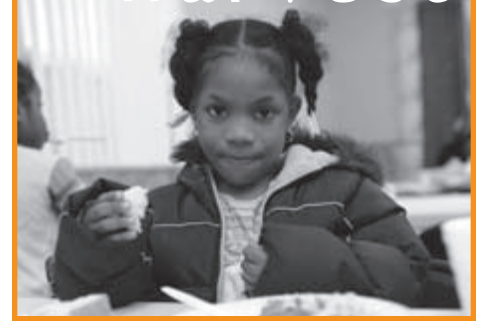
Children receive nutritious food from Kids Cafe meals during the summer months.

Research indicates that even mild under-nutrition during critical periods of growth can impact a child's behavior and cognitive development, making adequate nutrition crucial year round. And that's where The Food Bank's Kids Cafe program steps in, providing approximately 1,700 meals a day to at-risk children in Boys & Girls Clubs throughout eastern Massachusetts. Clubs such as the West End House in Allston, the Blue Hill Club in Dorchester, and Keane Children's Center/Ansis Youth Center in Charlestown serve dinners during the school year, but switch to breakfast or lunch to replace the school meals that the children no longer receive during the summer. These are the only nutritious meals that many of these children will eat during the long summer days.