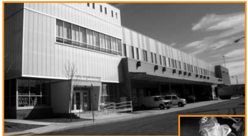
Top: The Greater Boston Food Bank awaits the start of another busy day.

In our first full year of operation, more than 4 million pounds of nutritious fruits, vegetables and other perishable items were distributed through our on-site dedicated shopping area, the Roche Family Marketplace. Vans and trucks from shelters and pantries all across the region pull in and out of our docks. Other trucks from food purveyors and distributors deliver food to The Food Bank. Warehouse workers efficiently unload pallets of potatoes, cereal, juice, and soup, and prep orders for agency pickup. Natural light pours into offices dedicated to food acquisition, member services, direct service programs, nutrition, volunteers — all focused on the mission of ending hunger in eastern Massachusetts.