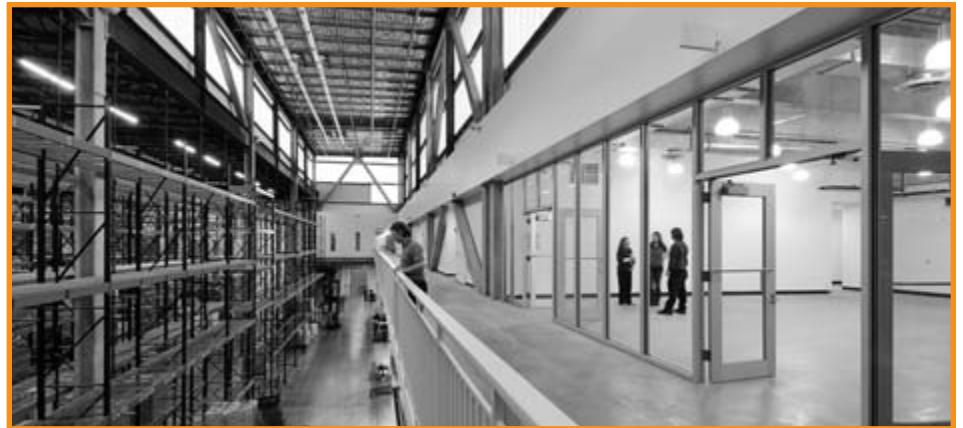
Natural light streams into the warehouse and along the second floor gallery.

9 a.m. Natural light streams into the enormous Rufus Lester Warehouse, which has nearly three times the dry storage of our previous facility, and the capacity to let us to distribute up to 50 million pounds of food and grocery products. The Yawkey Distribution Center meets the highest food industry standards and features cutting-edge "green" elements in its design. On the warehouse floor, forklifts move pallets in preparation for a week that will provide a nutritious supply of food to tens of thousands of people.