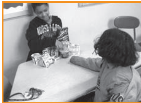
Students at the Connery Elementary School in Lynn, Mass., peruse the contents of a typical backpack.

Thirty-four percent of the 580 students in the Connery Elementary School participate in the BackPack Program in Lynn, a gritty industrial North Shore city where the recession hit hard, triggering a record number of foreclosures and hurting manufacturing workers. With 93 percent of the students eligible for free and reduced-price lunch, and all students eligible to get a free breakfast through a universal breakfast program, the BackPack Program fills a need during the weekends, when many